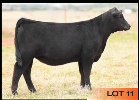
J&J Blackcap 540 DOB 9-3-15 Sire: OSU Final Exam Dam: J&J Blackcap 044