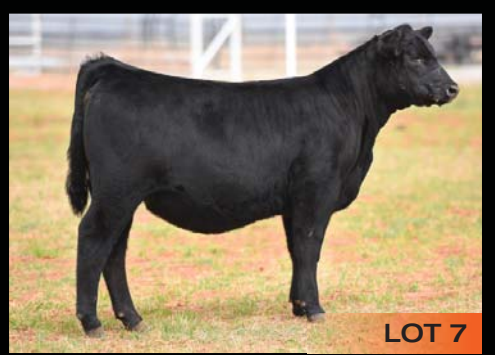
J&J Ever Entense 553 DOB 11-3-15 Sire: Dameron First Class Dam: Limestone Ever Entense S292