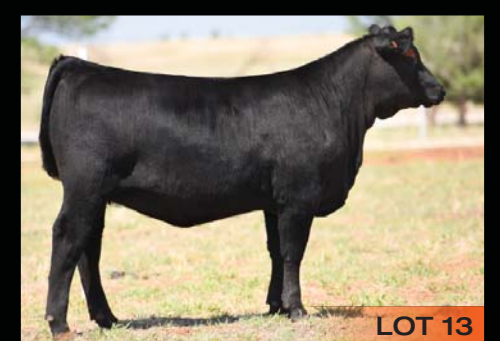
J&J Queen 544 DOB 09-18-15 Sire: Dameron First Class Dam: J&J Queen 867