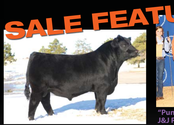
Dameron First Class Sire of 5 heifers and 3 Embryos