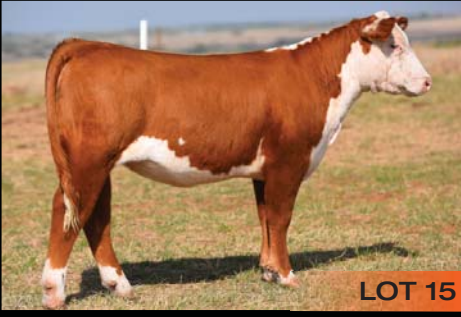
J&J Hannah 245 DOB 8-10-15 Sire: C Stockman 2059 Dam: EKS BLF Valentine A20