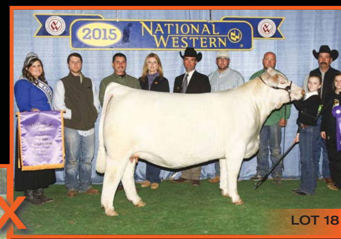
3 IVF Embryos Sire: HooDoo 357Y Dam: 3R'S Angelina 343A "JoJo"