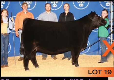
3 Reverse Sorted Female IVF Embryos Sire: GCC Irish Whisky Dam: J&J Royal Lass 422