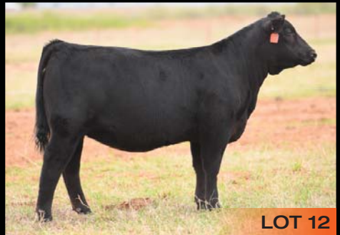
J&J Princess 538 DOB 09-02-15 Sire: Sedgewicks Outlaw Dam: Greens FB Princess 0812