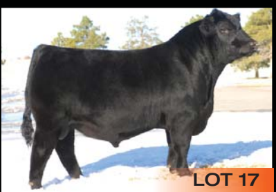
3 IVF Embryos Sire: Dameron First Class Dam: Limestone Ever Entense S292