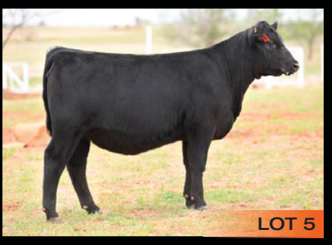
J&J Royal Lass 546 DOB 10-10-15 Sire: Dameron First Class Dam: J&J CAR Royal Lass 164