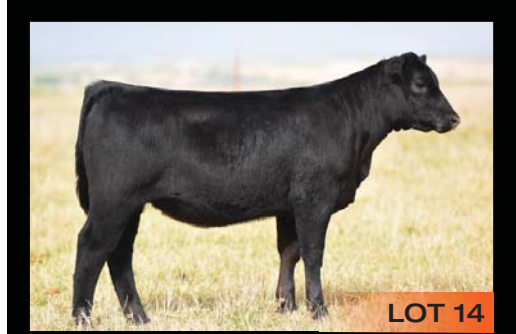
J&J Queen 543 DOB 09-18-15 Sire: Dameron First Class Dam: J&J Queen 867