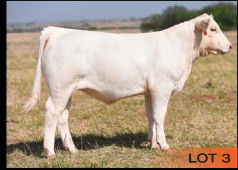
J&J Firegirl 552 DOB 10-10-15 Sire: Keys All State Dam: TR PZC Firegirl 9745 ET (2010 Nat'l Champion Charolais Female)