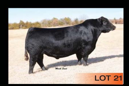
3 Units semen GCC Total Recall