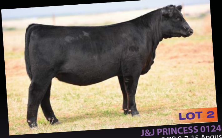
DOB 8-7-15 Angus Sired by Insight Produced by daughter of First Class

Schedule & Sale Bidding: Cattle are available for viewing at J&J Cattle Co. anytime.