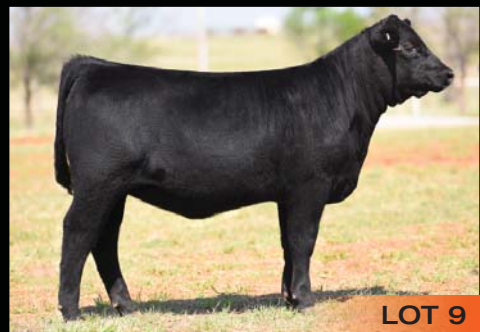
J&J Queen 515 DOB 9-10-15 Sire: EXAR Blue Chip Dam: OSU Queen 2139