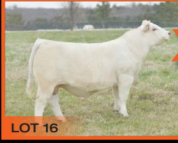
1 Female Pregnancy Due Nov. 2016 Sire: CCC WC Resource Dam: 3R'S Angelina 343A "JoJo"