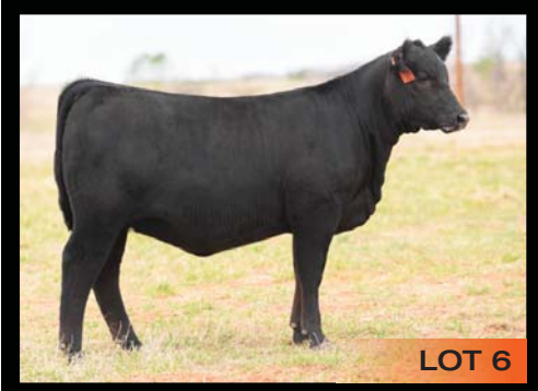
J&J Royal Lass 542 DOB 9-15-15 Sire: EXAR Blue Chip Dam: J&J CAR Royal Lass 164