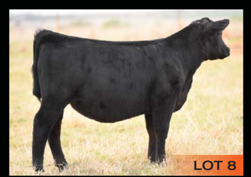
J&J Ever Entense 554 DOB 11-4-15 Sire: Dameron First Class Dam: Limestone Ever Entense S292