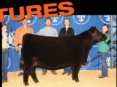
J&J Royal Lass 422 3rd Overall Angus at 2016 OYE