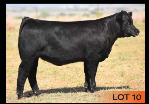
J&J Forever Lady 255 DOB 8-14-15 Sire: EXAR Blue Chip Dam: J&J Forever Lady 034