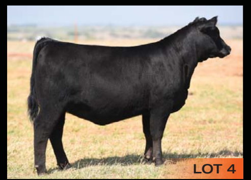
J&J Royal Lass 545 DOB 10-1-15 Sire: EXAR Blue Chip Dam: J&J CAR Royal Lass 164