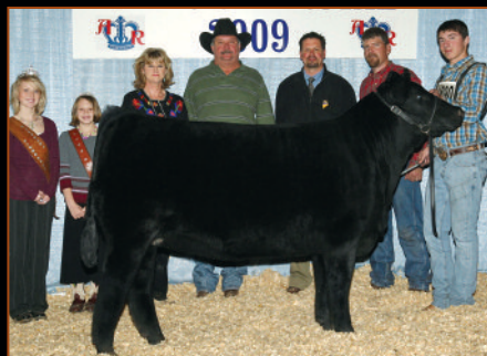
WLTR Lydia 39U ET (daughter of 414) Reserve National Champion Percentage Simmental Female