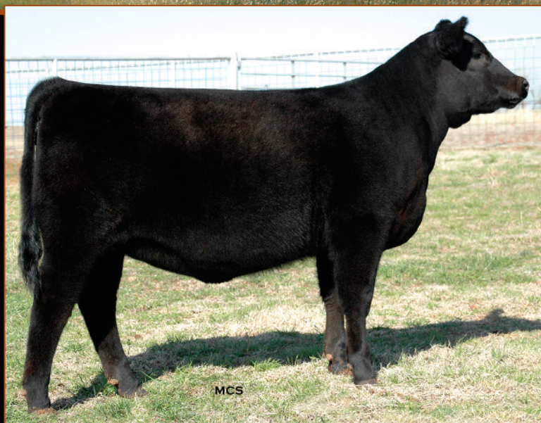
J&J Queen 9064 She sells! 9/02/09 • Sire: Raven • MGS: BR Midland

Selling registered Angus spring pairs, fall pairs, fall-born heifer calves, spring yearlings and pregnancies plus embryos from our ET program! ... At the ranch near Orlando, Oklahoma.