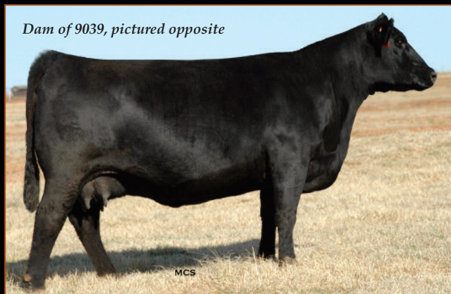
J&J Bardolena 530 [NHF] She sells! Sire: EXAR New Look • MGS: E161