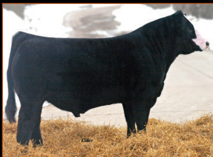
WLTR Renegade 40U ET (son of 414) 2010 NWSS Reserve Grand Champion Percentage Simmental Bull ... 39U and 40U are owned by Walter Cattle Co. and Gilbert Cattle Co.