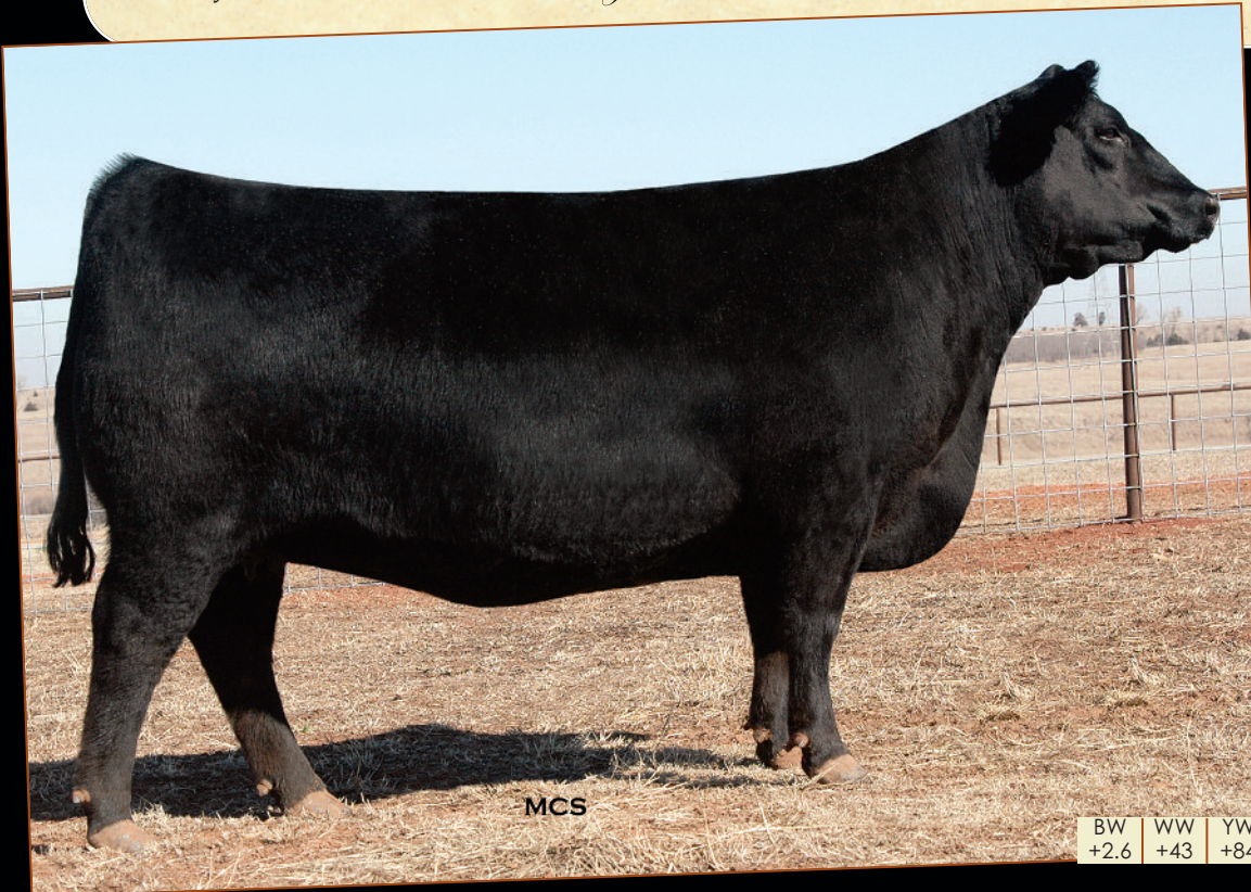
J&J Queen 414 She & her embryos sell Sire: Northern Improvement MGS: A&B Yukon

Featuring the most powerful J&J donor dams!