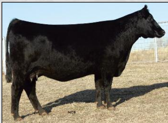
J&J Blackbird 536 Dam of Lots 25-28