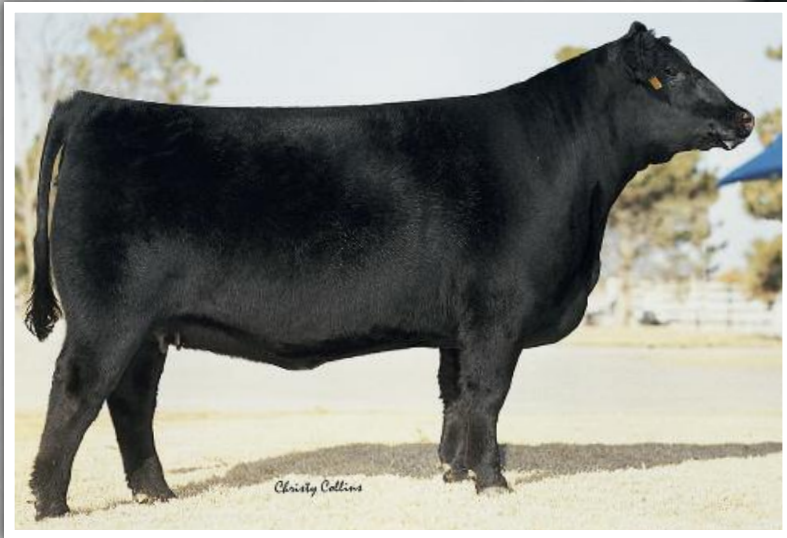
Leachman Blackcap 8261 Great grandam of Lots 30 & 31; grandam of Lot 60

• EPDs: BW 1+0.7, WW 1+46, YW 1+84, MILK 1+18, MARB 1+ .48, REA 1+ .52, $BEEF +50.93