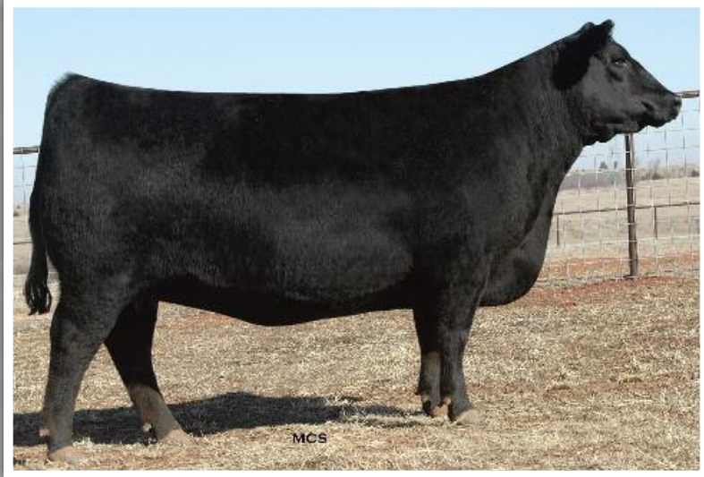
J&J Queen 414 Dam of Lots 29 & 46

• EPDs: BW 1+2.7, WW 1+52, YW 1+98, MILK 1+19, MARB 1+-.26, REA 1- .16, $BEEF +41.28